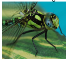
Plant / Insect Growth