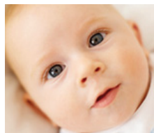
In vitro Fertilization (IVF) Clinics / University Hospitals