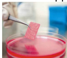
Bio Tissue Engineering