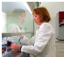
Basic Research / Research Institutes