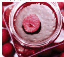
Food / Beverage